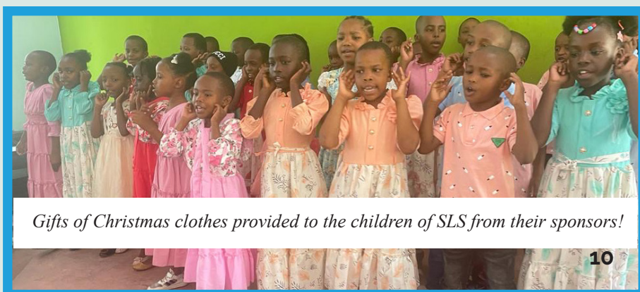
Gifts of Christmas clothes provided to the children of SLS from their sponsors!